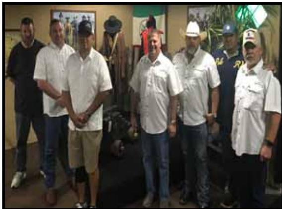
Recently members of the Deaf Smith chapter visited the Freeport Museum to view the Fort Velasco exhibit.