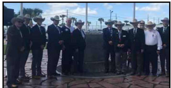
Members of the Deaf Smith, Sidney Sherman, and San Jacinto chapters at the dedication of the Santa Anna Capture Site.