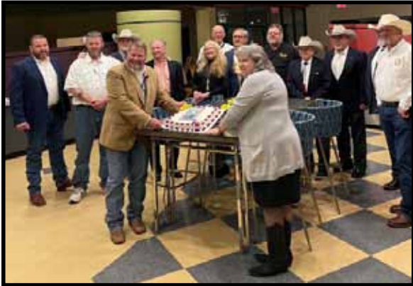
Members of the Deaf Smith chapter #60 celebrating the one year anniversary of the chapter.